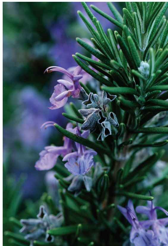
Rosmarinus officinalis of the Labiatae family

One mechanism of T cell inhibition may involve protein kinase enzymes. There are numerous protein kinases that play important roles in translat-